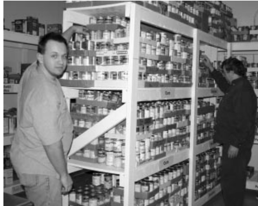
Teaching men in our recovery program the value of hard work and service is important to us. Our guests and volunteers help keep our shelves stocked and organized with canned goods which we use for meals at the Mission and distribute to families in the community.

Thank you for demonstrating through your service and gifts that you care for our hurting friends and neighbors in West Michigan. Through you, they see the love of Jesus Christ!